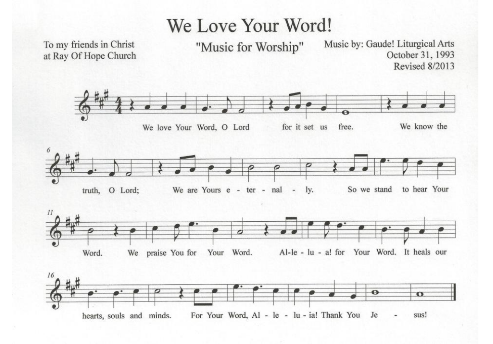
©1993 by Gaude! Liturgical Arts. All Rights Reserved. International Copyright Secured. Reprinted here under CCLI#706121

Reader: Truly present among us, the Lord is with you. ALL: And also with you.